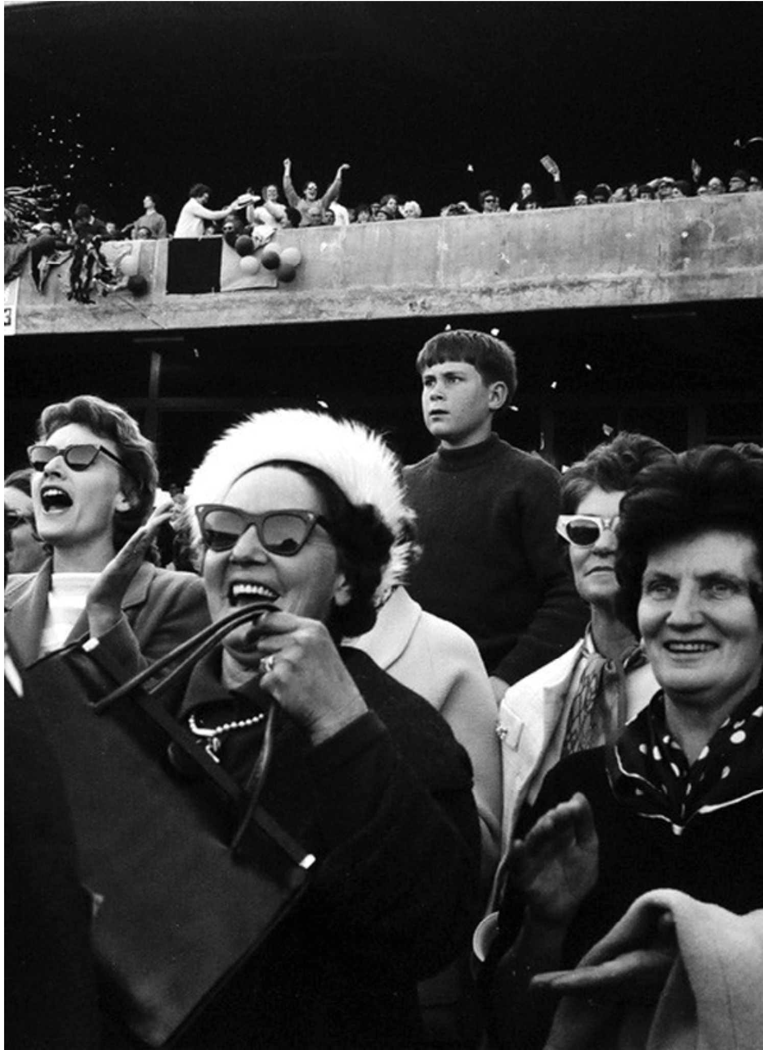
RENNIE ELLIS Footy fans, Grand Final, MCG 1969 (detail) Gelatin silver selenium-toned print, Monash Gallery of Art, City of Monash Collection