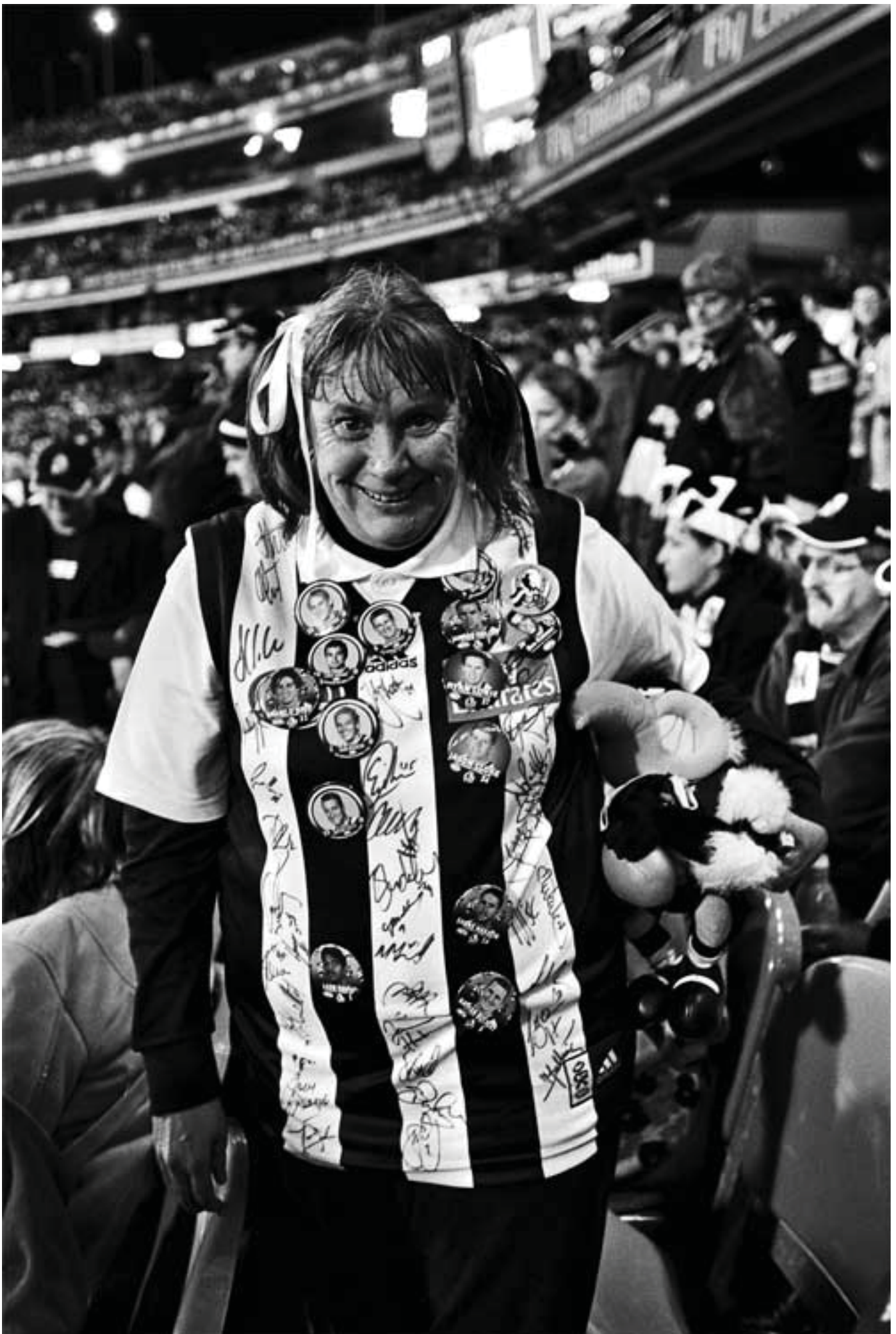
Previous page: Installation view