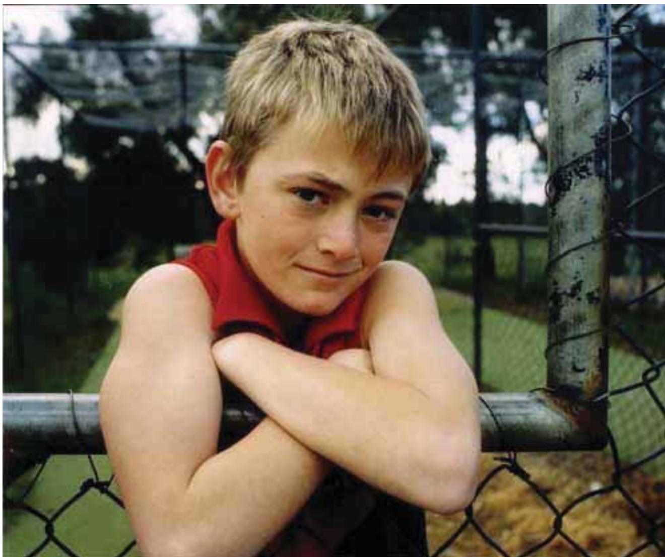
DONNA BAILEY Doggy 2006 chromogenic print, courtesy of the artist

A MONASH GALLERY OF ART TRAVELLING EXHIBITION