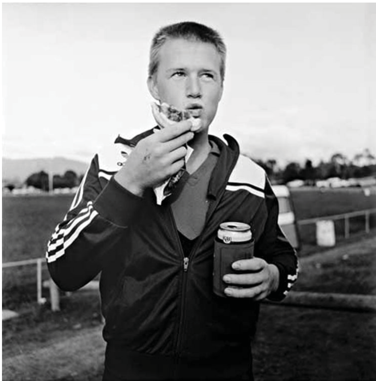
GRANT HOBSON Shane 1988 gelatin silver print, courtesy of the artist

A MONASH GALLERY OF ART TRAVELLING EXHIBITION