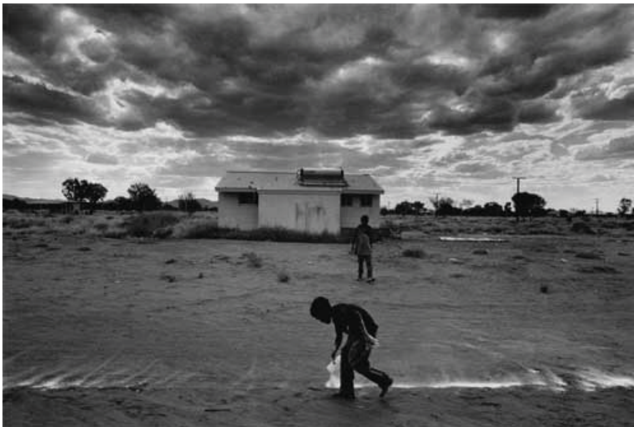
JESSE MARLOW , The boundary line, Papunya, NT 2002 chromogenic print, Monash Gallery of Art, City of Monash Collection