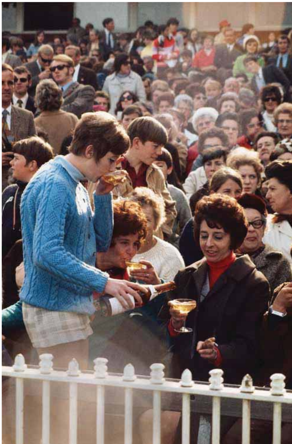
RENNIE ELLIS Champagne fans c1970 chromogenic print, Monash Gallery of Art, City of Monash Collection

A MONASH GALLERY OF ART TRAVELLING EXHIBITION