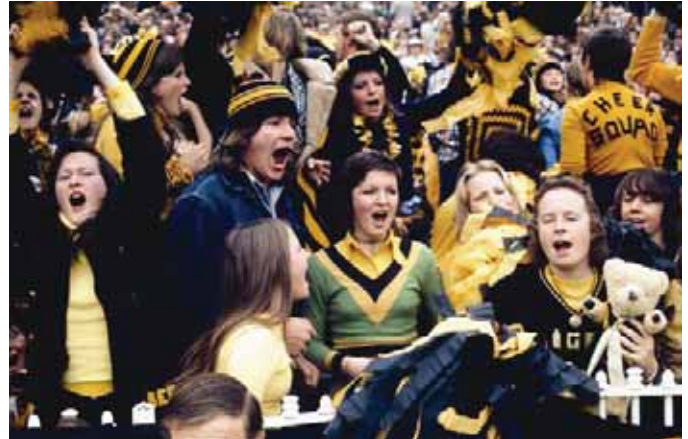
RENNIE ELLIS Richmond fans, Grand Final, MCG 1974 chromogenic print, Monash Gallery of Art, City of Monash Collection