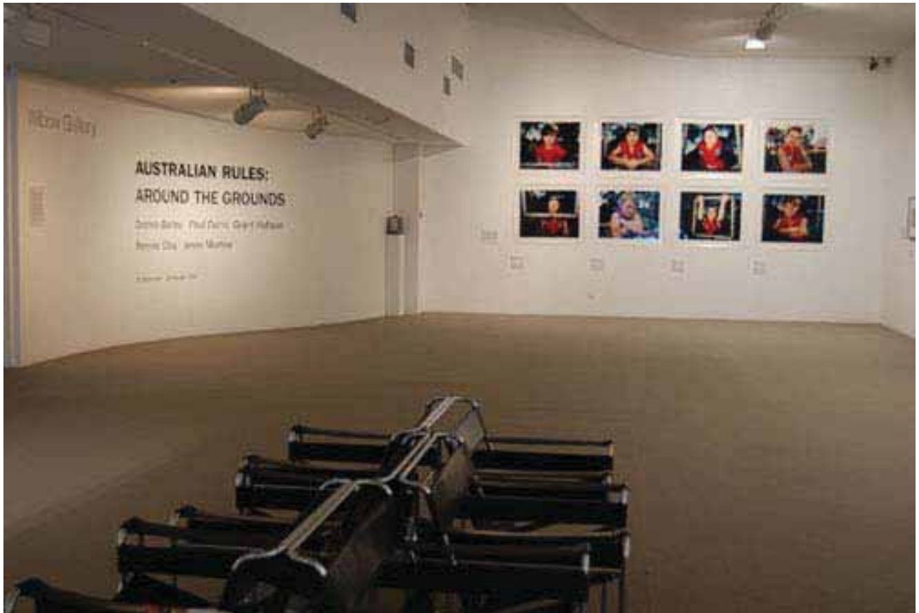
Installation view 2007

A MONASH GALLERY OF ART TRAVELLING EXHIBITION